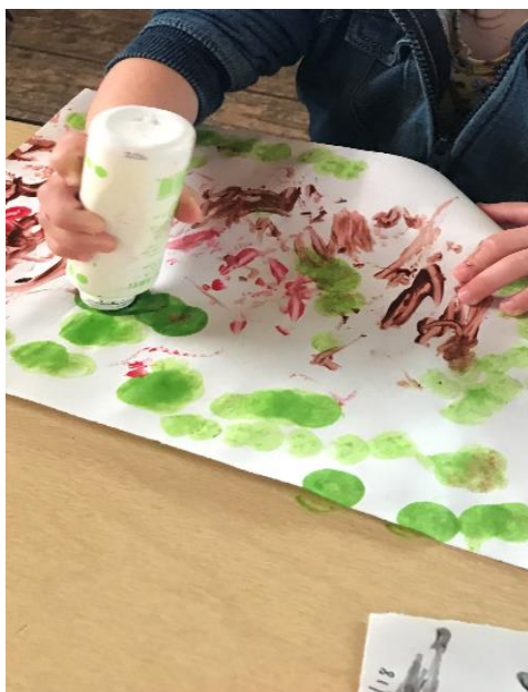
Roller painting and stamping