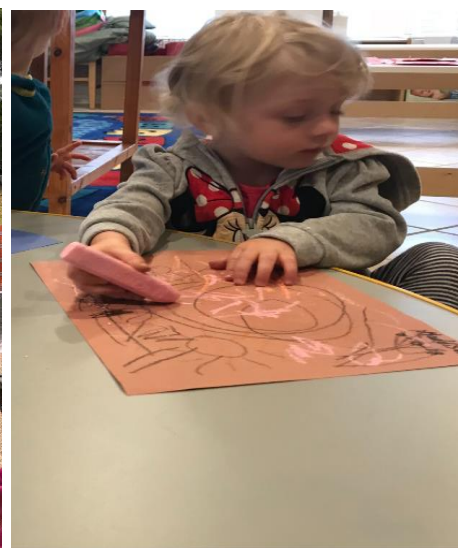
Monte Tavor ... A world of learning and playing