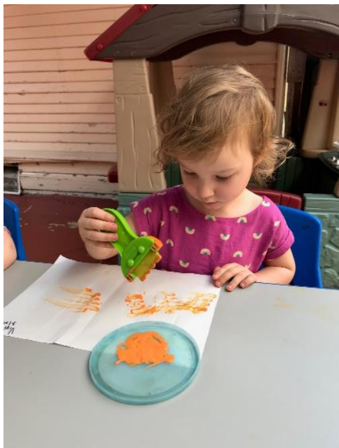
Art tools: Scrappers and Rollers

Children 15months and older participate in an age appropriate art curriculum