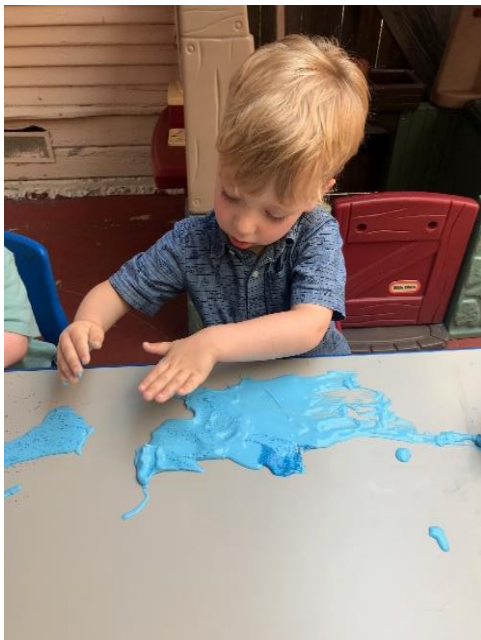
Sticky Matter, while not getting dirty