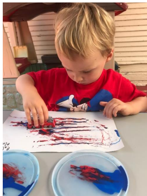
Car, train, and airplane painting